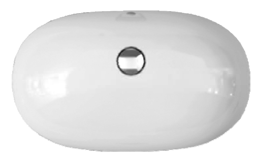
Drain not provided